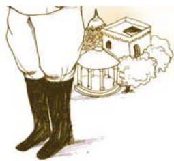
Illustration: Karno Guhathakurta

that ensures not only sustainability but also fairness, transparency and accountability? The colonial forest department treated the forest as its property and was accountable for its upkeep. Working plans were written in English and accessed only by foresters. Hundreds of princely states were allowed to have their own procedures. Zamindari was promoted in many areas to simplify revenue